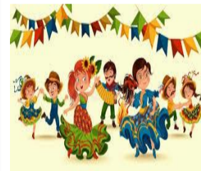
Footwork Fiesta- Dance Competiton Class I