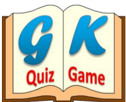
G.K Quiz Class-II