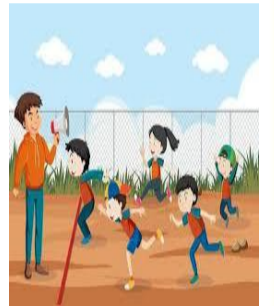
Annual Sports Carnival Class I and II