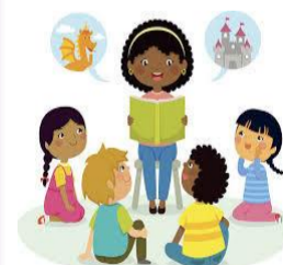
Story Weaving Activity Class II