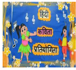
Hindi Recitation Competition Class I