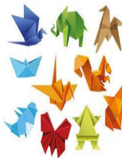
Fun With Origami Class I & II