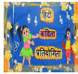
Hindi Recitation Competition Class II