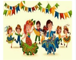
Footwork Fiesta- Dance Competiton Class II