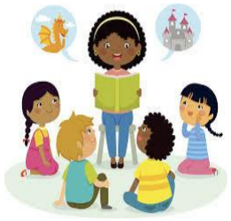
Story Weaving Activity Class I