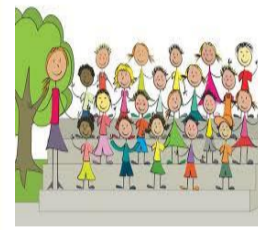
Class Photograph Class – I and II