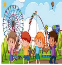
Picnic Class-I and II